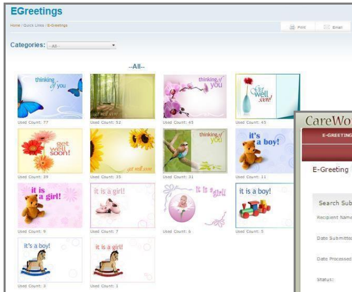
Front End – Example of an E-Greetings Selection Page